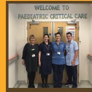
“Outstanding Health Care Award” Finalists 2018 for our excellence in recognition of individual needs and care.