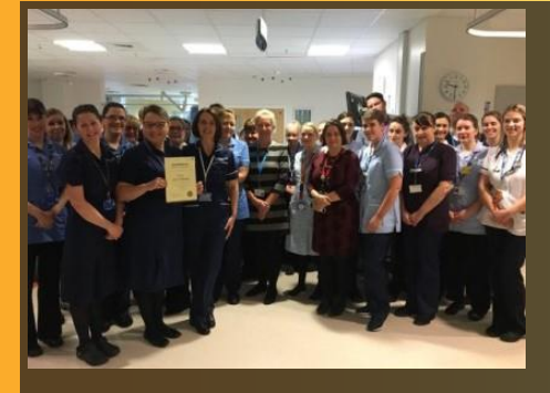
MFT Excellence Award

Paediatric Critical Care hold MFT **GOLD** accreditation status.