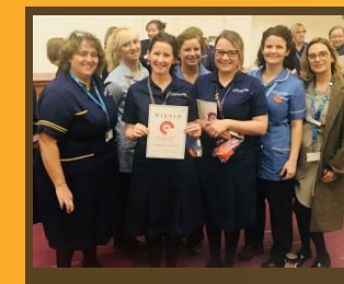
Winners of MFT Brilliant Basics Quality Improvement Project.